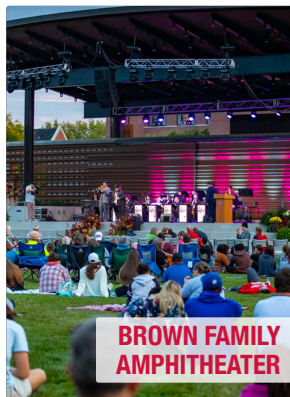
BROWN FAMILY AMPHITHEATER

Application deadlines and start dates vary by program. For more information, visit bsu.edu/admissions/graduate/apply .