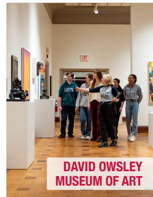
DAVID OWSLEY MUSEUM OF ART