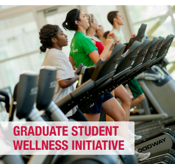
GRADUATE STUDENT WELLNESS INITIATIVE