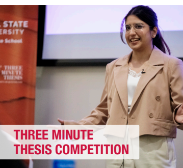
THREE MINUTE THESIS COMPETITION