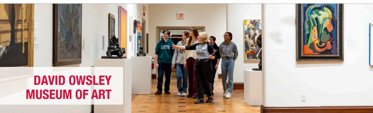
DAVID OWSLEY MUSEUM OF ART