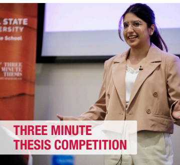
THREE MINUTE THESIS COMPETITION