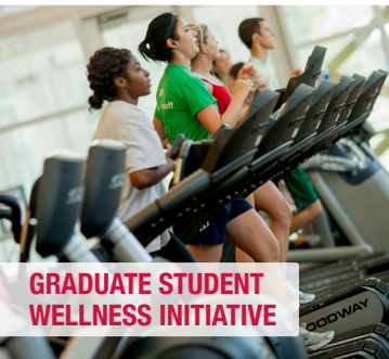
GRADUATE STUDENT WELLNESS INITIATIVE