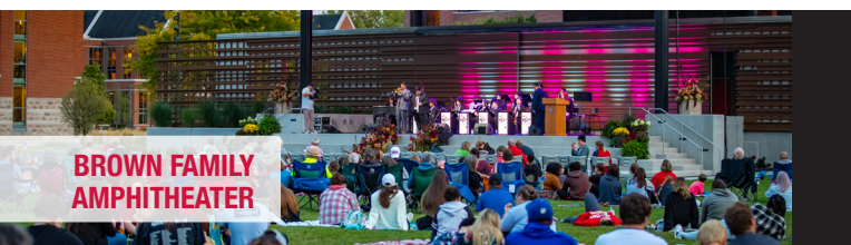
BROWN FAMILY AMPHITHEATER