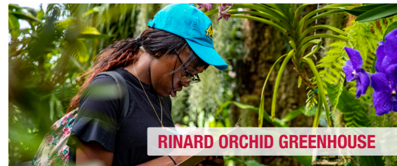
RINARD ORCHID GREENHOUSE