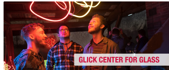
GLICK CENTER FOR GLASS