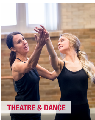
THEATRE & DANCE