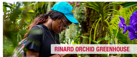
RINARD ORCHID GREENHOUSE