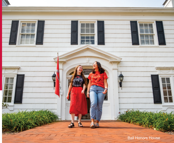
Ball Honors House